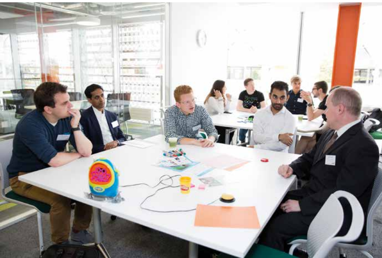
Image: Breakout session at the 2017 summit.

We look forward to receiving your submissions!