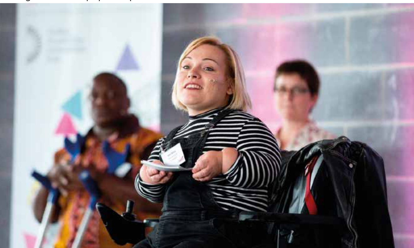
Image: Call for papers speaker 2017 summit.